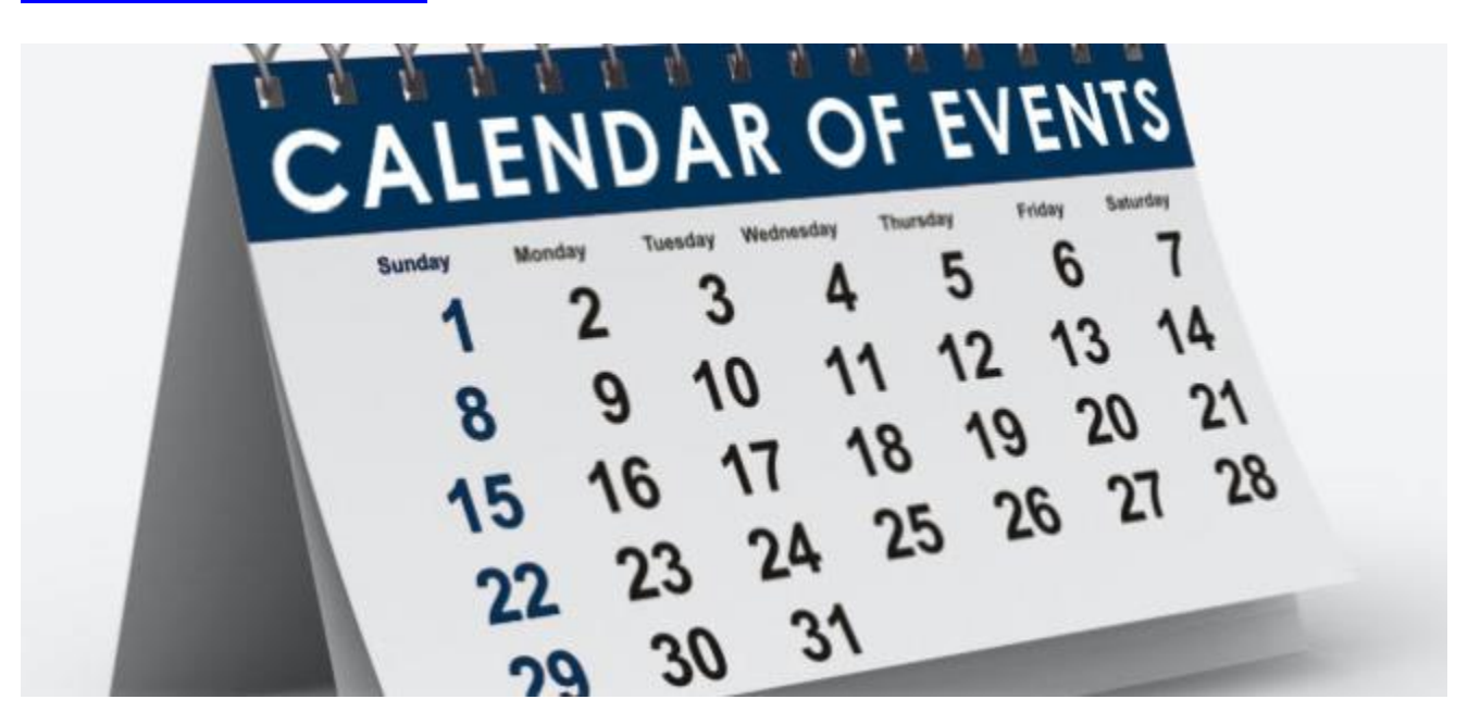
Featured ~ ginalaborde